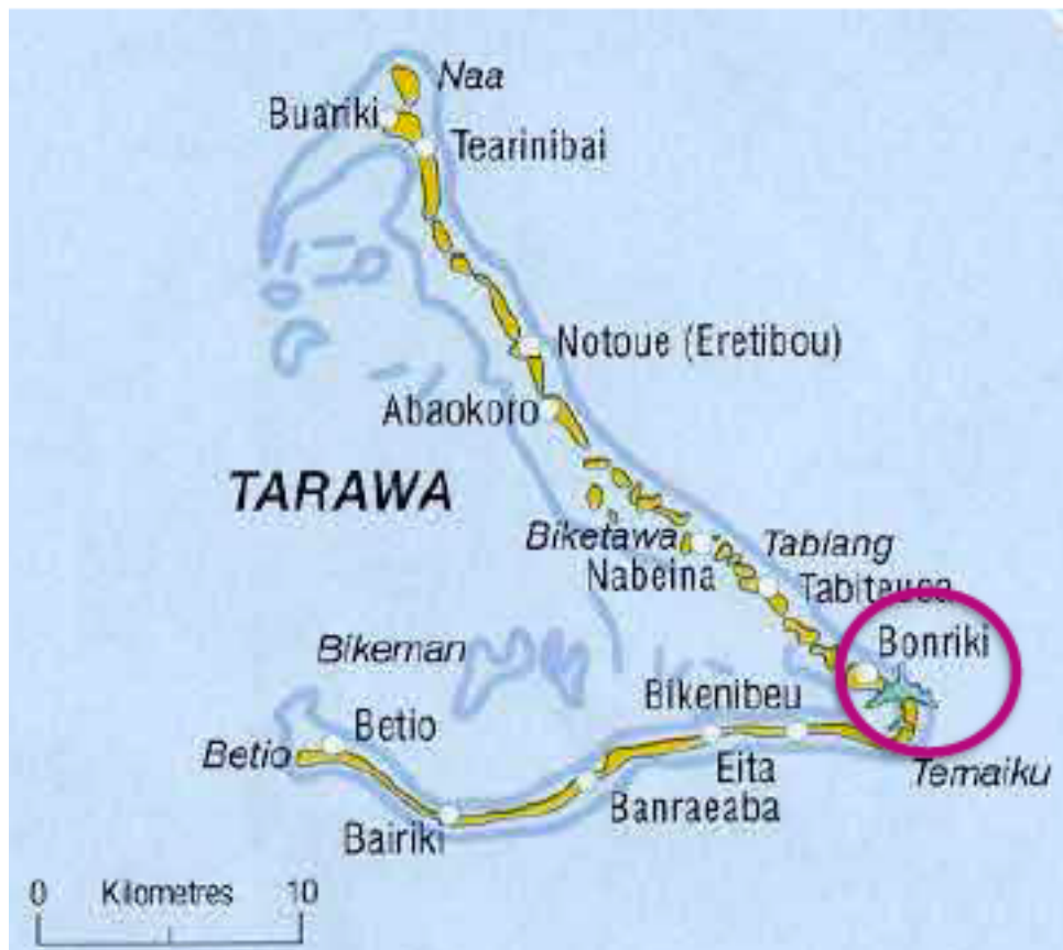
Figure 2 Bonriki International Airport

To facilitate the current and expanded maintenance requirement, Air Kiribati requires the construction of a new hangar and facilities at Bonriki International Airport on the Atoll of Tarawa. Maintenance work is currently carried out within a hangar and office complex adjacent to the terminal building. The Gilbert island fleet consists of two DHC6 twin otter aircraft, one Harbin Y12, and one DHC8 dash 8 aircraft. The Line Island fleet based on Christmas Island consists of two Harbin Y12 aircraft. Due to the distance involved, these aircraft are not maintained at the Gilbert island base. The current Bonriki (Gilbert Island) facility is constrained and offers no room for growth. In addition, the two Embraer 190 aircraft will require parking and at least basic maintenance.